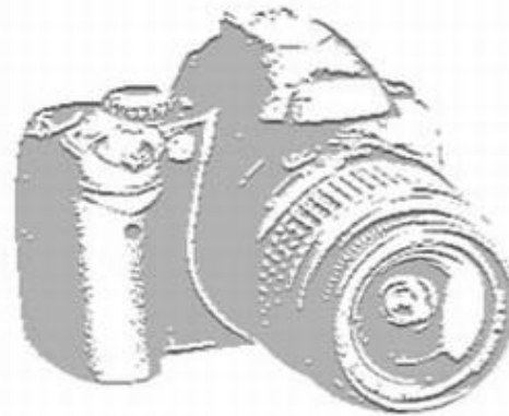
PHOTO NOT AVAILABLE