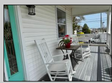
99 Holly Hills Somers Point, NJ 08244