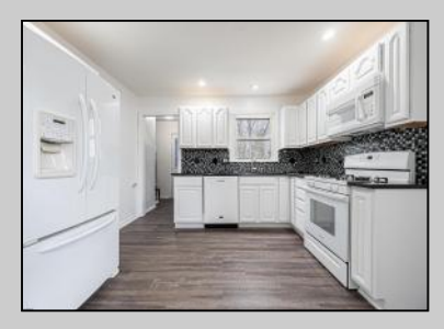
100 Cindy Drive Egg Harbor Township, NJ 08234