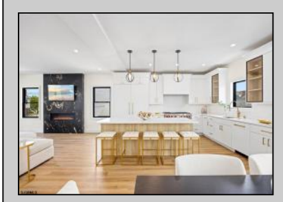
213 Iroquois Margate, NJ 08402