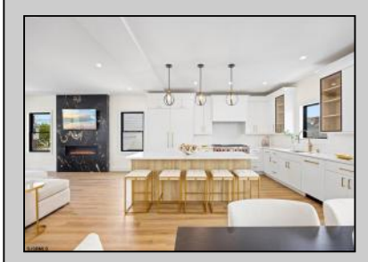
213 Iroquois Margate, NJ 08402