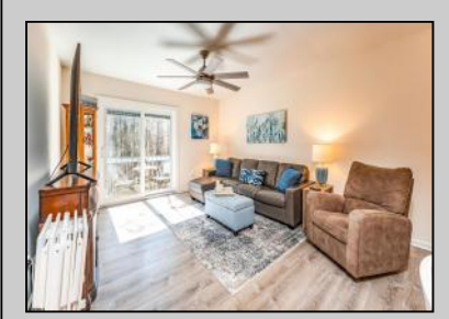
80 Club Place Galloway Township, NJ 08205