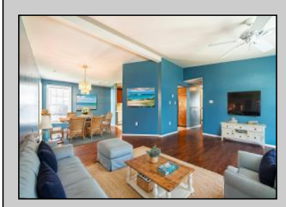
63 Knollwood Mays Landing, NJ 08330