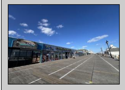
1214 Boardwalk Ocean City, NJ 08226