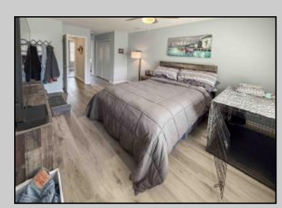
722 Fishers Creek Galloway Township, NJ 08205