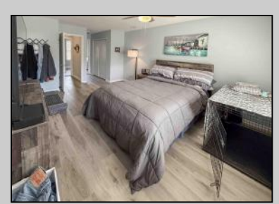
722 Fishers Creek Galloway Township, NJ 08205