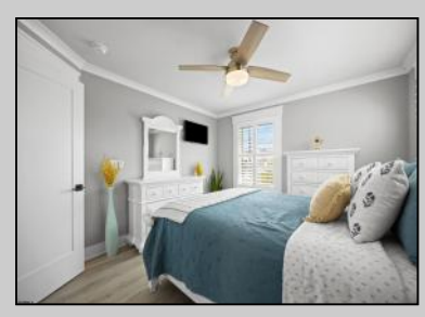
1129 West Ave Ocean City, NJ 08226