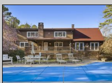
2350 7th Ave Hammonton, NJ 08037