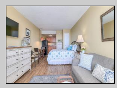
3408 Haven Ave Ocean City, NJ 08226