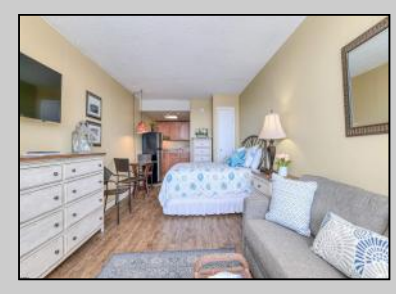
3408 Haven Ave Ocean City, NJ 08226