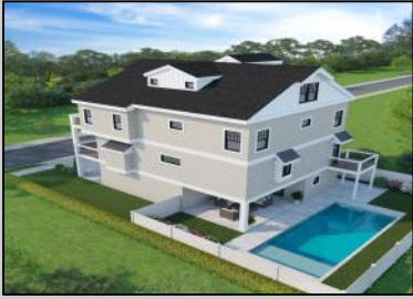
2 Pembroke Margate, NJ 08402