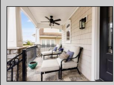
28 Huntington Margate, NJ 08402