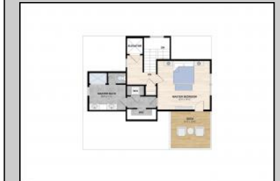
100 Frontenac Margate, NJ 08402