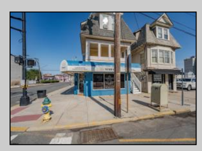
846 Central Ocean City, NJ 08226