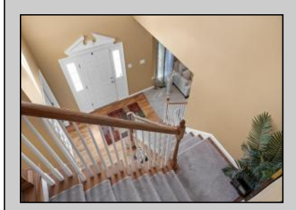
970 Venezia Ave Vineland, NJ 08361