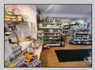
644 White Horse Pike Egg Harbor City, NJ 08215