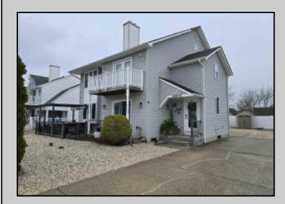
1 Lighthouse Cove Brigantine, NJ 08203