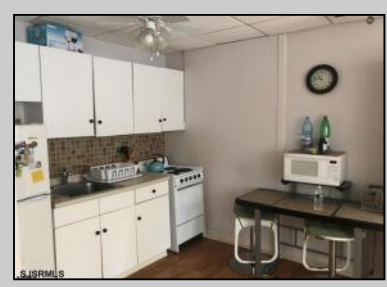
2834 Atlantic Atlantic City, NJ 08401