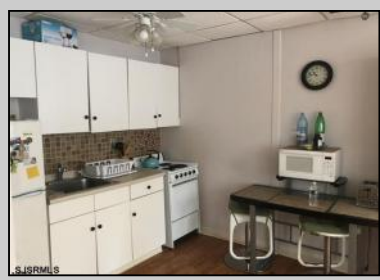
2834 Atlantic Atlantic City, NJ 08401