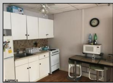
2834 Atlantic Atlantic City, NJ 08401