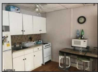
2834 Atlantic Atlantic City, NJ 08401