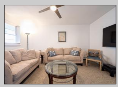
21 Monroe Margate, NJ 08402