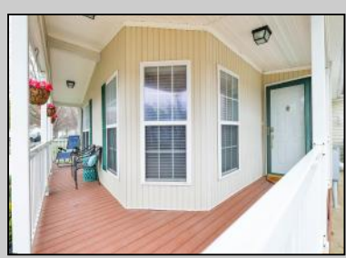
59 Knollwood Mays Landing, NJ 08330