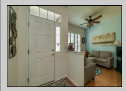
81 Burnside Egg Harbor Township, NJ 08234