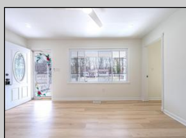
4037 Adams Cir Hammonton, NJ 08037