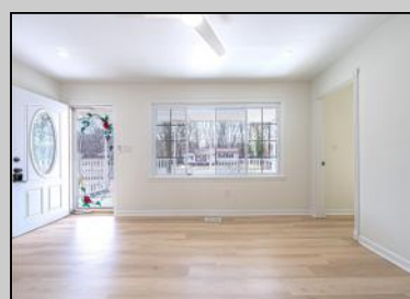
4037 Adams Cir Hammonton, NJ 08037