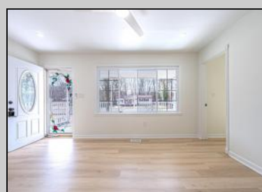
4037 Adams Cir Hammonton, NJ 08037