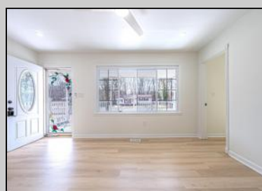
4037 Adams Cir Hammonton, NJ 08037