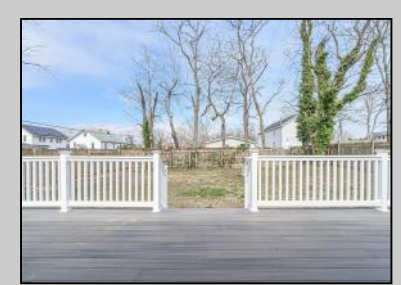
28 Thompson Pleasantville, NJ 08232