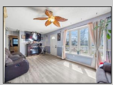
510 Wharton Park Mullica Township, NJ 08037