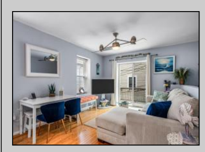
9704 Ventnor Ave Margate, NJ 08402