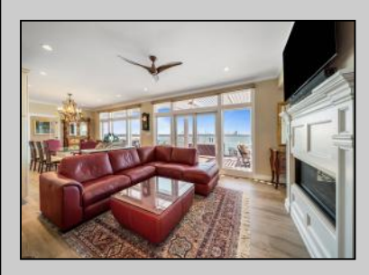
724 Shore Brigantine, NJ 08203