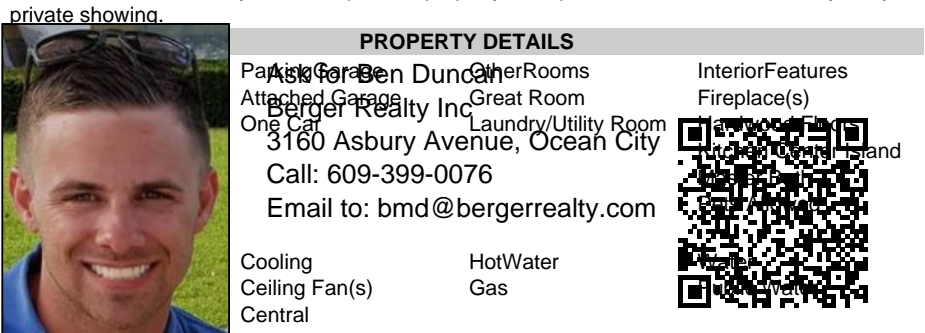
Sewer Public Sewer