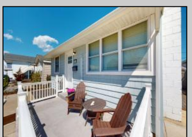
231 33rd Brigantine, NJ 08203