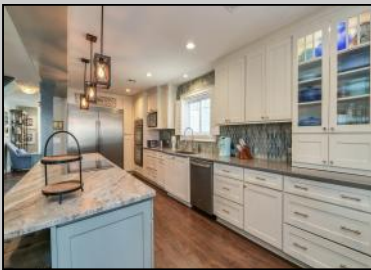
304 Essex Margate, NJ 08402