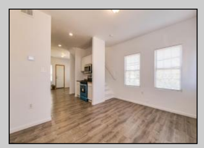
222 Chalfonte Ave Atlantic City, NJ 08401