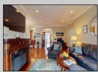
348 Sunflower Egg Harbor Township, NJ 08234