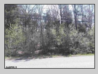
260 Odessa Galloway Township, NJ 08215