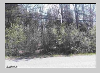
260 Odessa Galloway Township, NJ 08215