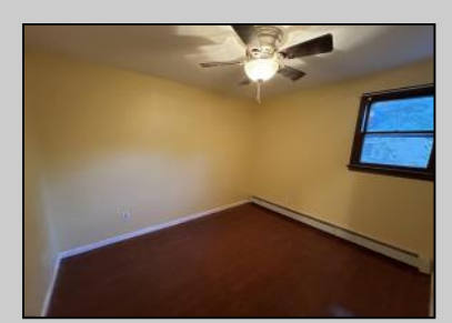
462 Nectar Avenue Galloway Township, NJ 08205