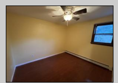
462 Nectar Avenue Galloway Township, NJ 08205