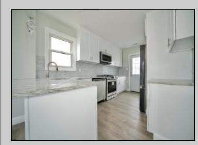
106 Toulon Egg Harbor Township, NJ 08234