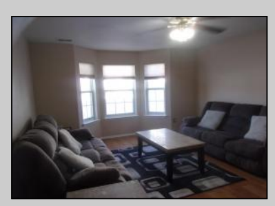
75 Anchorage Atlantic City, NJ 08401