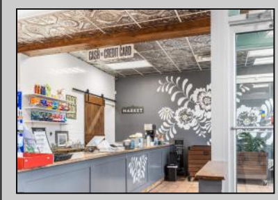
45 New York Galloway Township, NJ 08205