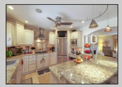
10 Sunset Ave Linwood, NJ 08221