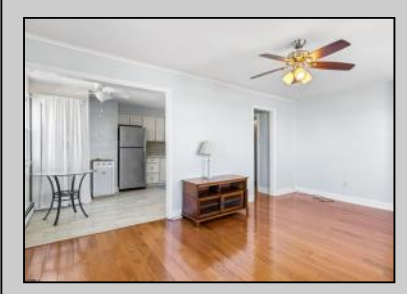
5402 Suffolk Ct Ventnor, NJ 08406